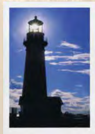
Lighthouse Christian Academy applauds you on your achievement. May the Lord continue to bless you in all your future endeavors.

Nothing stands the test of time like gold. Its durability ensures lasting value over time.