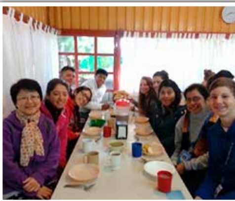
The first task of the Service Adventure participants was to organize into teams.