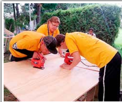
They then learned the skills they would need—like carpentry.