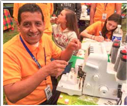
Others learned how to sew in order to make student uniforms.