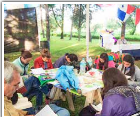
Each day began in prayer and Bible reading.