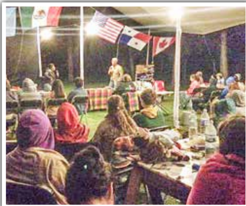
As the participants gathered, they could only imagine what adventures await.

Do your students seek adventure? Are they interested in making a difference in someone's life for the Lord? During the 2015 Service Adventure in Mexico, an administrator from Thailand found out what it was like to be a missionary. Along with 64 participants from six countries, she optimistically served with the group to improve the Learning Centers of several schools using the A.C.E. program and curriculum. Here is a report of her experiences.