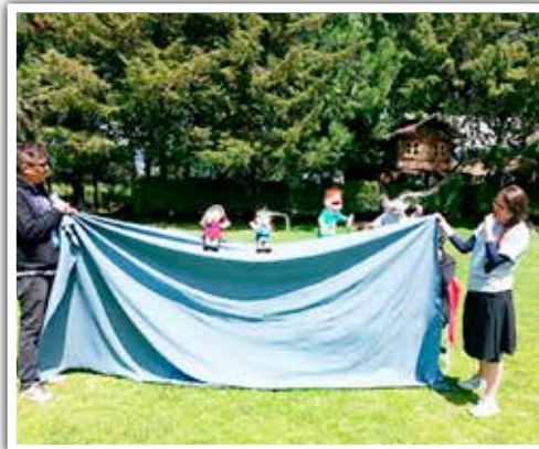
Puppets used to minister to children in Mexico.