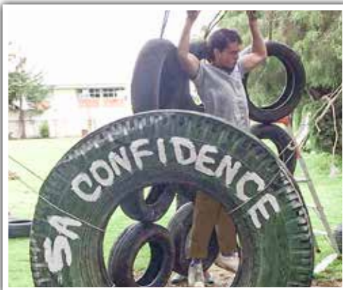
Fun activities to build team spirit such as the Service Adventure Confidence Course.